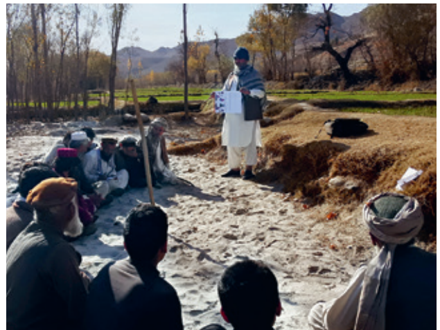
Afghanistan: Gender segregation is strictly observed. All the more important it is for our local partner to reach men too, with issues relating to pregnancy and childbirth.