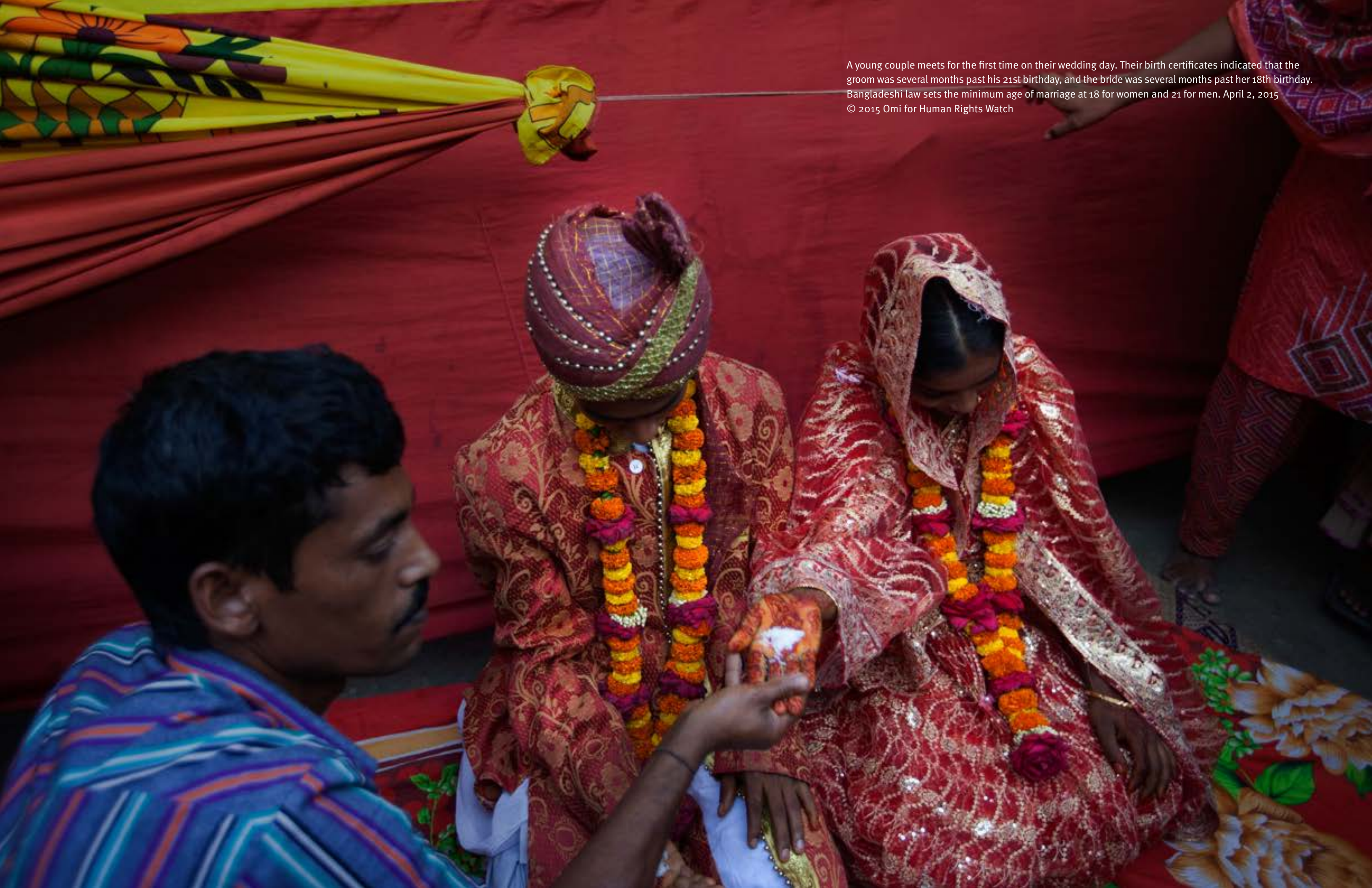
A young couple meets for the first time on their wedding day. Their birth certificates indicated that the groom was several months past his 21st birthday, and the bride was several months past her 18th birthday. Bangladeshi law sets the minimum age of marriage at 18 for women and 21 for men. April 2, 2015